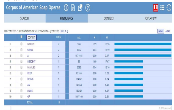
Figure 4: Collocated words with the word "Arab" in COCA

As it is discernible the words "tour", "division", "passport", "market", "honey moon" and "vacations" are notable. Europeans countries Associating travelling and the destinations for Americans' vacations and honey moons, distributing market for American goods can be culturally meaningful. Regarding Arabs, unlike the previous three cases in which the corpus provided a wide range of collocations from which the highly frequent ones on top of the table were selected and presented, only 10 findings were presented. This poor representation of Arab in soap opera might suggest the less consideration of Arabian culture in American soap operas. Noticeable collocated words are "keep", "small", "families", and "descent" which may refer to Arabs' small families in America and their relations.