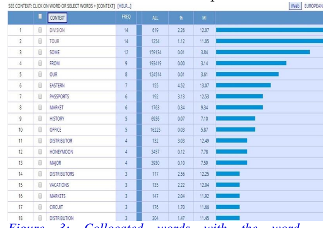
Figure 3: Collocated words with the word "European" in COCA

Having mentioned these, once again based on Lewis's categorization of cultures, Africans are talkative, they do several things at once, they plan grand and outline only, are emotional, display feelings, confront emotionally, have good excuses, often interrupt others' speaking, are peopleoriented, put feelings before tasks and finally their conception of truth is flexible. Based on these items the following cultural words were extracted from the list of collocated words with African. Art, artists, artifacts, artwork and talented artists are all words that can be related to both their emotional and feeling display aspects. Other words like market, company and money can be associated with the idea that culturally they are people oriented and talkative and may have active roles in money-related businesses. Some other cultural aspects can be related to African but are not in Lewis's list are wildlife, wild and diamond. Regarding the representation of "Europeans" in American soap operas in the time span of 2001 to 2012 the collocated words with this word were investigated. figure presents the following collocated with the word "European".